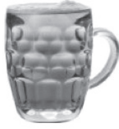
A half pint of lower strength (4%) lager, beer or cider