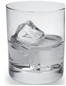
A double measure of spirit (40%)