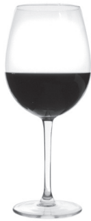
A large glass (250ml) of lower strength (12%) wine